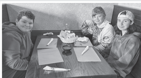
Pictured above: MMS 8th graders enjoy lunch at Casa Mezcal in Downtown Mosinee.